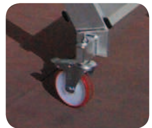
Rueda retráctil Retractable wheels