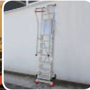
Súper compacta y ligera. Super compact and lightweight.